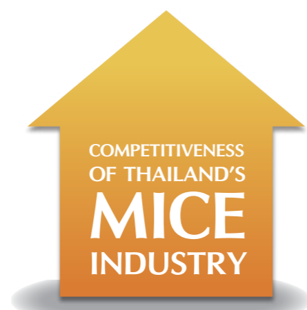
Fast Track Service

To support and reinforce service performance of government agencies in order to boost the competitiveness of Thailand's MICE industry.